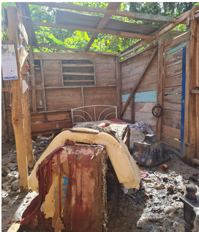
Figure. 3. Flood affectations in Pandora Oeste, July 2021

In addition to the historical context and the flood scenarios described, the residents were consulted regarding their experiences with the effects of flooding, the greatest being food loss reported by 79 participants, followed by water supply and infrastructure damage, which were mentioned by 73 and 72 people, respectively. Regarding infrastructure damage, several houses have been damaged, including the one shown in Figure. 3, which was declared a total loss by the National Emergency Commission in 2021, and the property now has restrictive regulations on the construction of any type of infrastructure.